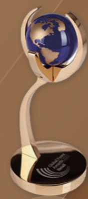
Best Forex Fintech Broker

IEXS has continuously received recognition and awards from authoritative institutions, highlighting the company's strengths in fund security, business foundation, and trading services, as well as reflecting the company's customer-centered service philosophy. The award mainly recognizes the best-performing brokers globally and regionally, rewarding companies that provide top-notch trading technology, low-cost trading, comprehensive market research tools, advanced education programs, and world-class customer service to investors or traders.