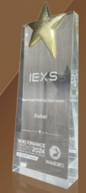
Best Forex Trading Experience

In January 2023, IEXS Securities won the industry authority award - "Best Forex Fintech Broker in Asia for 2022". We stood out as the winning brand in this nomination with our competitive trading technology and world-class customer service.